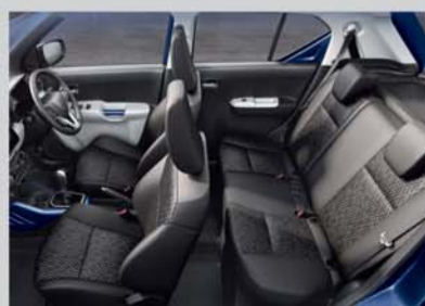
Spacious and Comfortable Interiors