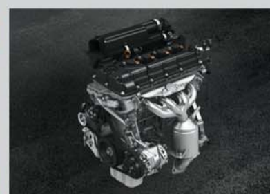
1.2L VVT Petrol Engine

NEXA Safety Shield STANDARD ACCROSS ALL VARIANTS