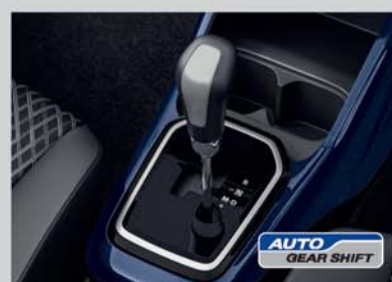
Auto Gear Shift