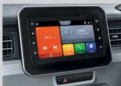
17.78 cm Smartplay Studio (Available from Zeta variant onwards)