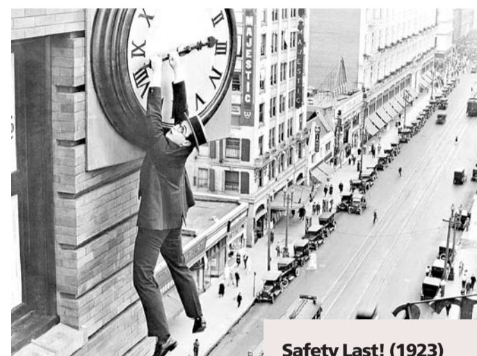
Safety Last! (1923)

In the forthcoming Mission: Impossible film, Tom Cruise drives a motorbike off a cliff and wrecks a 70-tonne train. But how does such derring-do compare with cinema's most hair-raising escapades?