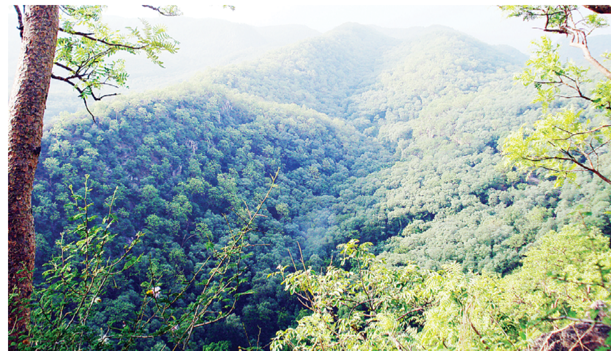
The luxuriant forests of Sariska have always attracted the Bollywoodians.