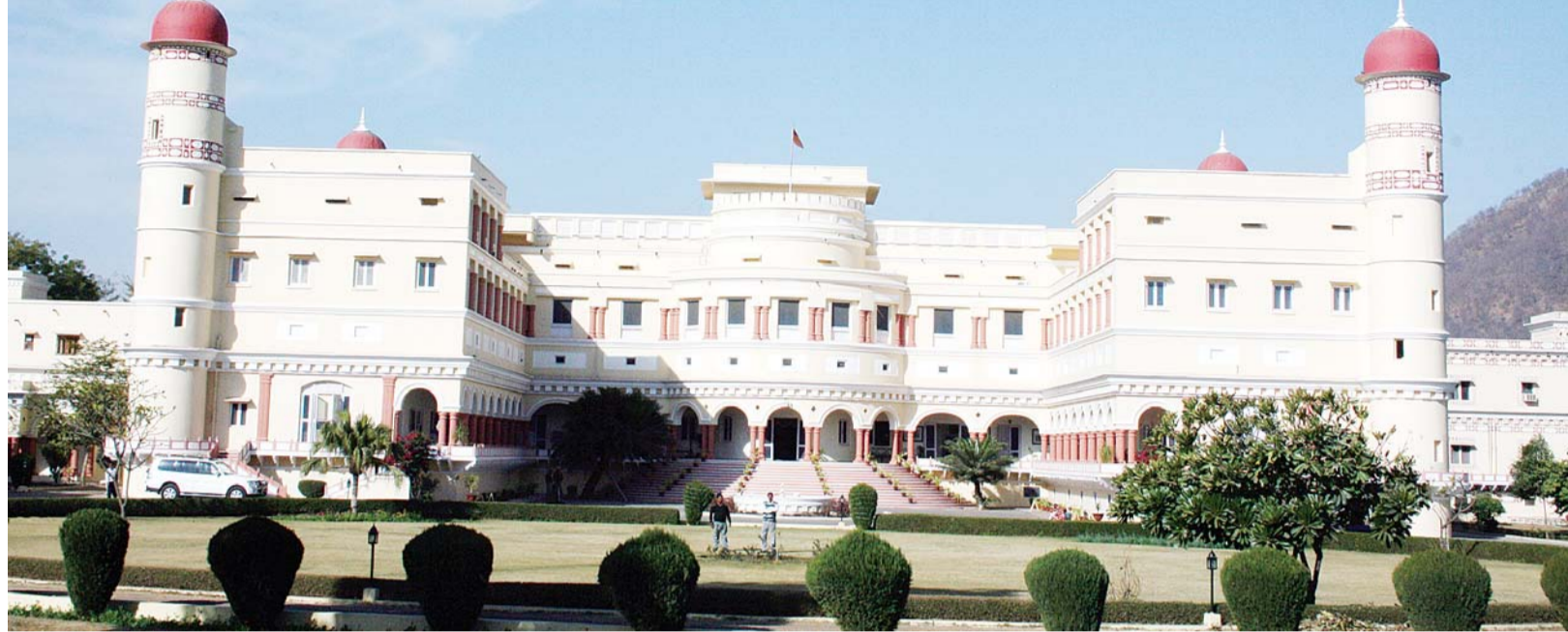
Sariska Palace, where large part of the film shooting was done.