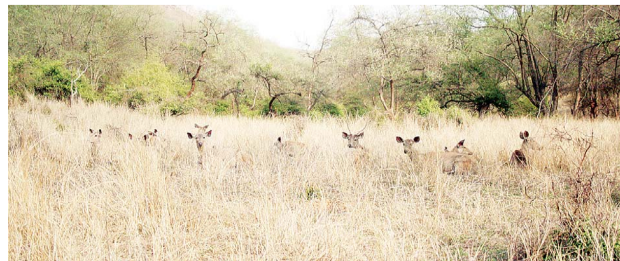
Sambar herd, aware of their great wild beauty, were quite inquisitive about the visitors.