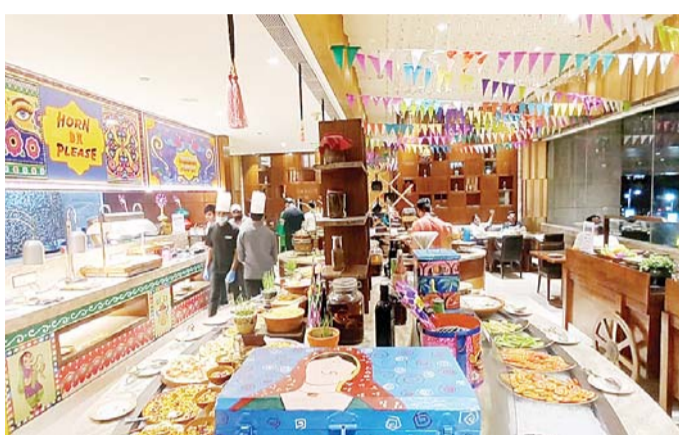
Punjab Di Mehek at Holiday Inn Jaipur.

From the flavours of Japan to the delicacies of Punjab and Mumbai, there is a lot on offer for the foodies of Pink City this month.