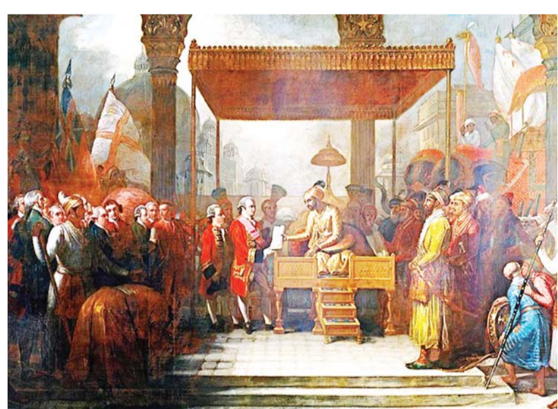
Shah 'Alam conveying the grant of the Diwani to Lord Clive.