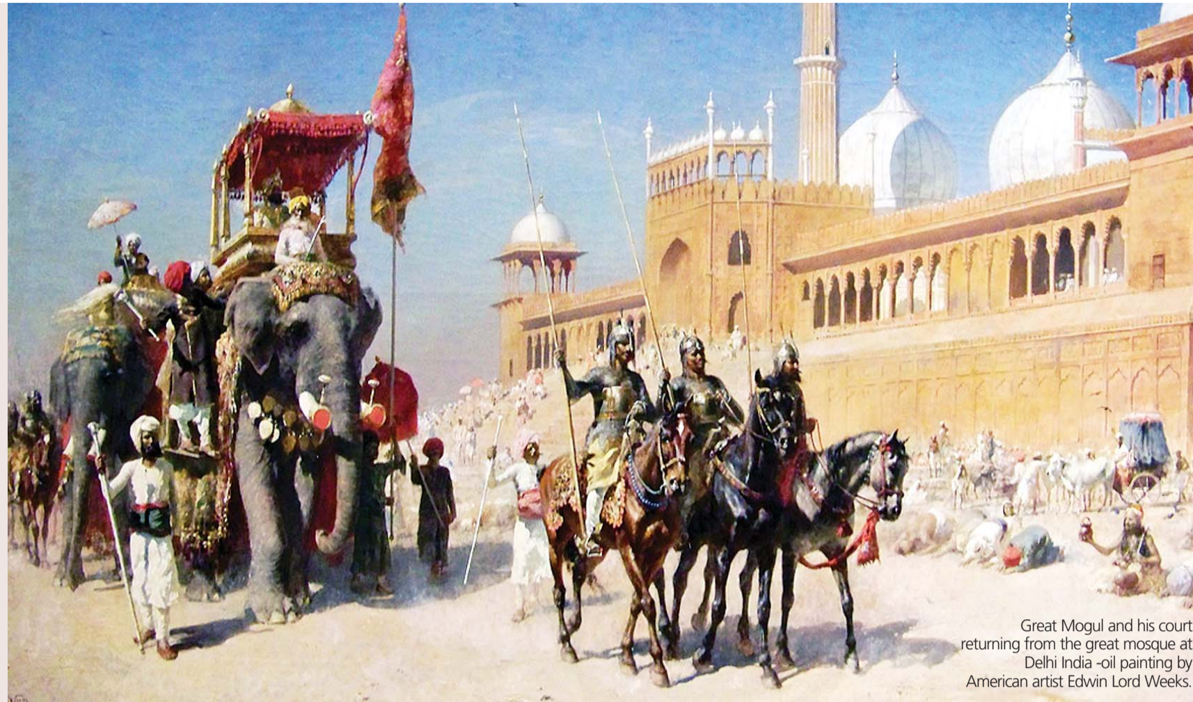
Great Mogul and his court returning from the great mosque at Delhi India - oil painting by American artist Edwin Lord Weeks.