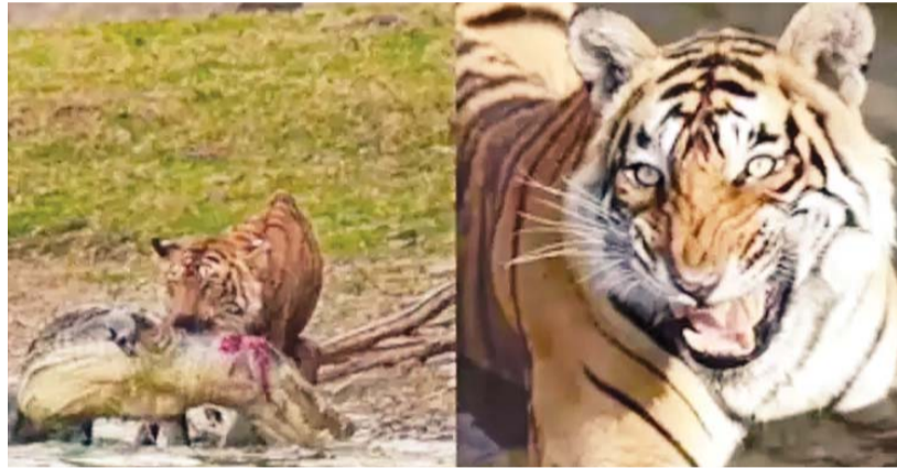
Ranthambore National Park's tigress Arrowhead dies hours after daughter Kankati's relocation.

Tigress Arrowhead (T-84) is no more, with her ends an era in Ranthambore. Till just two days before her death due to bone cancer, she was looking after her young brood, her semi-grown cub was relocated to another part of the jungle just the day before. She was one of India's most iconic tigers, whose life journey became a symbol of grace, strength, and resilience. Known as the 'Queen of Ranthambore,' Arrowhead's reign over the wilds of Rajasthan's Ranthambore Tiger Reserve was marked by her impressive hunting skills, fierce protection of her cubs, and a lineage that made her an emblem of conservation success.