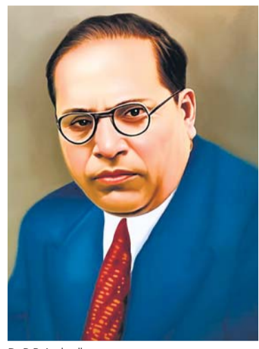
Dr B R Ambedkar