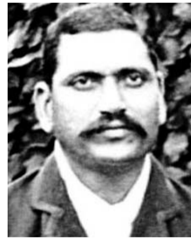
Palwankar Baloo-the first dalit cricketer