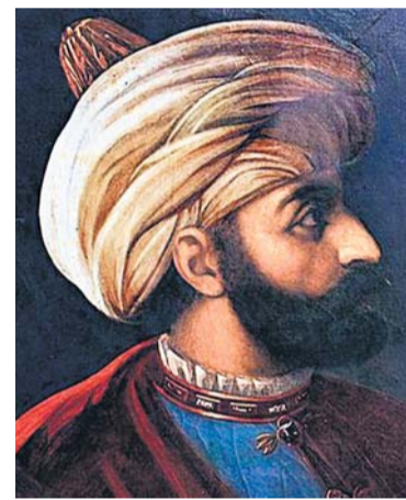
Sultan Murad III.