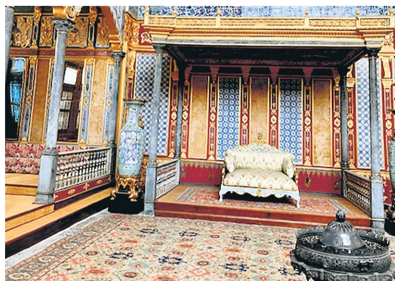
Inside the Topkapi Palace.

he wealth of sixteenth-century Hindustan (India) was very attractive to the Ottomans in Istanbul. The 'Ottomans' were a feared war machine, but the 'Mughals' had more wealth at that time in history. Ottoman Sultan, during Humayun's early reign, was a young and ambitious Suleiman, who had been on his throne since 1520. His armies had already become feared, after his conquests of Rhodes, Hungary, and the Balkan States by the time he turned his attention to Hindustan. The 'Ottomans' were fierce, sworn enemies of the 'Shah of Persia.' The Ottoman sultan was also contemptuous of the new upstart, Babur, whom they referred to as a 'Timurid' (descendant of Timur), not even acknowledging him by his name. In the early formative stages of the 'Mughal Empire' in Hindustan, Suleiman was too busy 'conquering other lands.' His spies were watching Hindustan, and the Ottomans were convinced that the new upstart Babur's dynasty would not last, particularly, since they had a very good read on the weak character of his son, Humayun. The Ottomans became