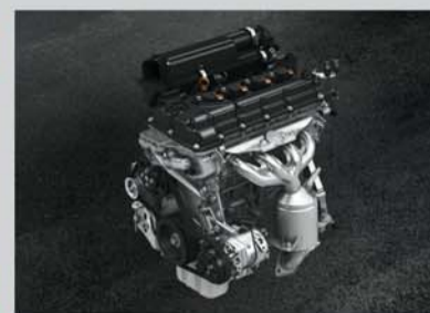
1.2L VVT Petrol Engine