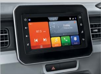
17.78 cm Smartplay Studio (Available from Zeta variant onwards)