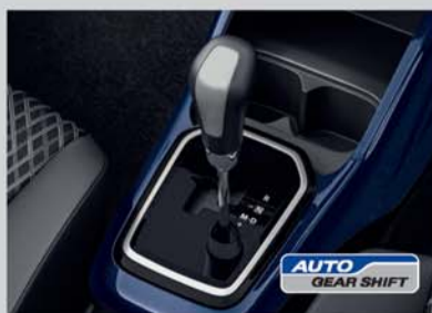
Auto Gear Shift