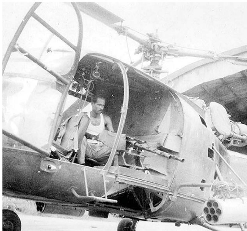
Helicopter of kilo flight armed with a machinegun.

With an estimated 390 million speakers, Arabic is one of the most widely spoken languages in the world. It is also one of the six official languages of the United Nations, as well as the liturgical language of 1.6 billion Muslims. Being one of the only modern languages to be written and read in a right-to-left form, Arabic is a fascinating language with a long history. For all of these reasons and many more, we can all agree that Arabic is more than deserving of its very own day.