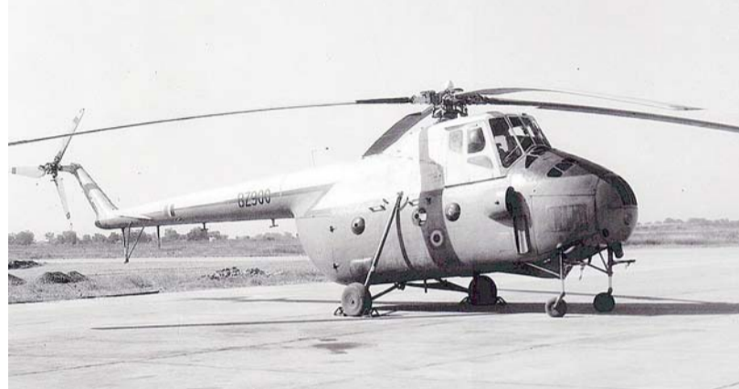
Mi-4 helicopters served the Indian Air Force from 1962 to 1983.

and shoot me". With that the officer turned away and we could breathe easy."