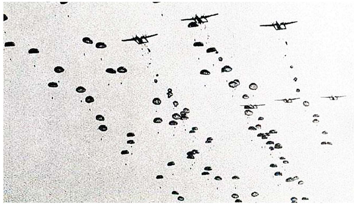
Army para-dropped infantry into East Pak.