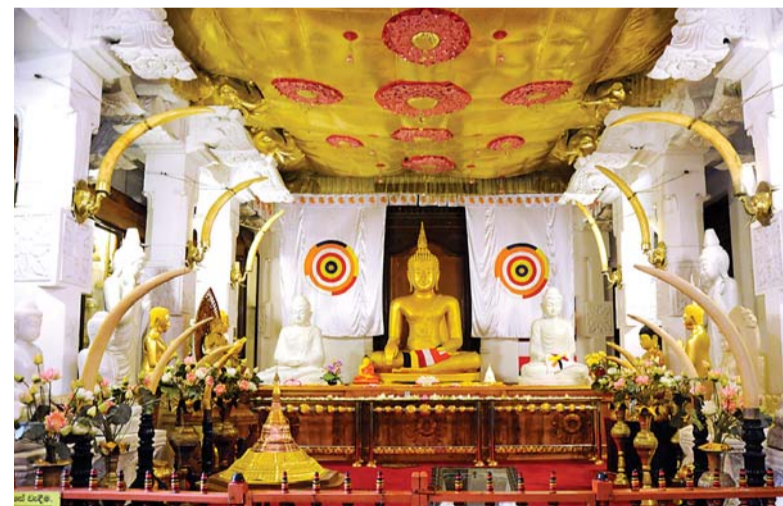
Temple Sacred Tooth Relic, Kandy, Sri Lanka.