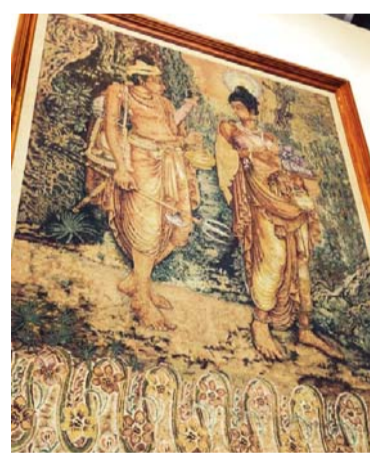
Princess Hemamali and her husband, Prince Dantha. Princess Hemamali carried Gautam Buddha's tooth relic, hidden in her hair, to Sri Lanka.

In the 4th Century AD, the last Indian ruler to possess the Tooth relic was Guhasiva of Kalinga. Guhasiva, in order to prevent its possession by his enemies, who made war, sent the tooth to Sri Lanka through his daughter Princess Hemamali and her husband, Prince Dantha. Princess