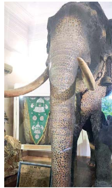
Elephant Raja stuffed remains.

The tooth temple was refurbished again as it was attacked by the Liberation Tigers of Tamil Eelam (LTTE), very recently in 1998. In early 1998, Sri Lanka was ready to celebrate its 50th independence anniversary from Great Britain. Charles, Prince of Wales, with several foreign dignitaries, were scheduled to arrive in the following days. Kandy City was chosen as the host for such an important event on February 4th. On 25th January 1998, the LTTE exploded a massive truck bomb inside the Temple of the Tooth premises. The attack caused severe damage to the temple, especially to its roof and the facade. But neither its inner chambers nor the tooth relic were harmed. Complete restoration took more than one and a half years to complete. Earlier also, the temple sustained damage from bombing in 1989, but was fully restored, that time also. All damaged sculptures were made new, and damaged paintings on lime plaster were reassembled and reintegrated with the existing pieces.