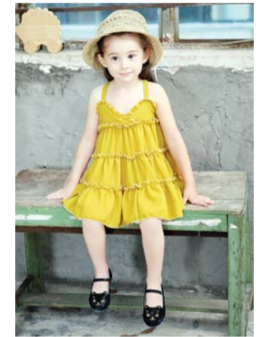
Cotton Dress - Sandals

Simple tees and shorts never go out of style and are a fashion staple for the entire year. No matter what the season is (except, maybe winters) your boy can sport this outfit with a pair of easy crocs.