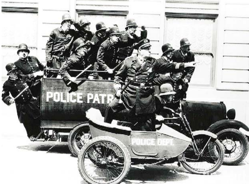
Keystone cops on patrol!

After being amused by these antics serious thinking needs to be done about the law and order situation along the borders in India. As it is a state subject each police force receives their orders from the ruling government of the moment and hence indirectly from the political masters. Politicians have elephantine memories. It is common for them to seek and create situations where the opponents are earmarked for past harassment or 'sins' done earlier. The police of the state change its colour like chameleons. The newly appointed officers have to prove their loyalty to the present government.