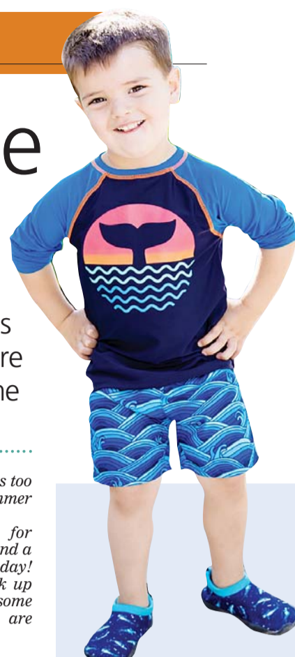
T-shirt - Shorts - Crocs

or carrying an umbrella. Kids too love summers - courtesy: summer vacation. Summer vacation calls for summer camps, workshops, and a day-long of playing every day! This means you should stack up your child's wardrobe with some breezy summer clothes that are perfect playtime outfits.