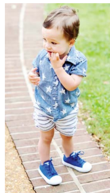
Get your son a pair of cool slip-ons to complete the playtime outfit.

If your daughter isn't much of a dress-lover, you can get her a pair of denim shorts or chino shorts. Pair this with a baggy top with prints that echo the summer vibe. You can choose an off-shoulder or cold-shoulder top to go with the shorts. A simple braid and a pair of sandals will perfect your little girl's look.