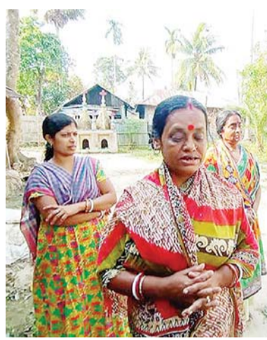
Immigrants trying to settle after crossing the border.