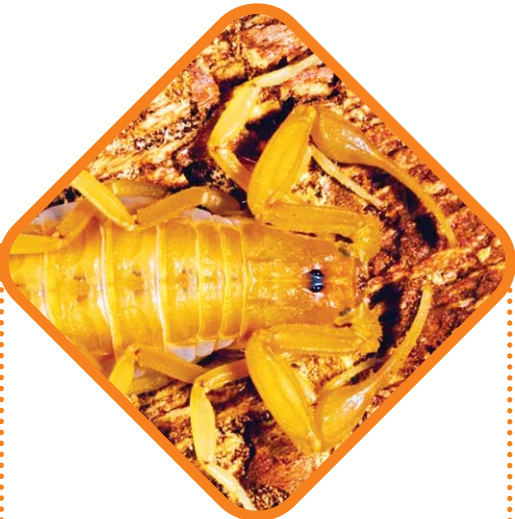
Arizona Bark Scorpion

Arizona bark scorpions are the most venomous scorpions in North America, a frightening fact considering that they're also the most commonly encountered house scorpions in Arizona. The venom causes acute pain and can lead to symptoms that include frothing at the mouth, breathing difficulties, and muscle convulsions. Limbs may also become immobilized. Though the venom is rarely fatal, its effects can last for as long as 72 excruciating hours. Arizona bark scorpions tend to hide in dark crevices during the day and hunt at night.