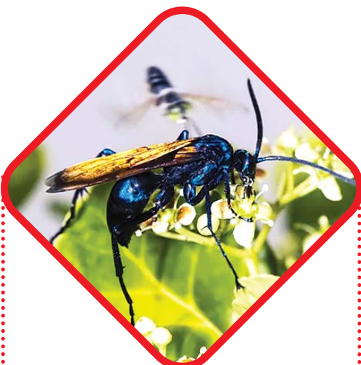
Tarantula Hawk Wasp

A Gila monster bite will cause pain in humans, but fortunately, these creatures are mostly docile towards people as long as they're left alone. If one does bite you, pry open its jaws with a stick while ensuring the lizard has a solid foothold on the ground.