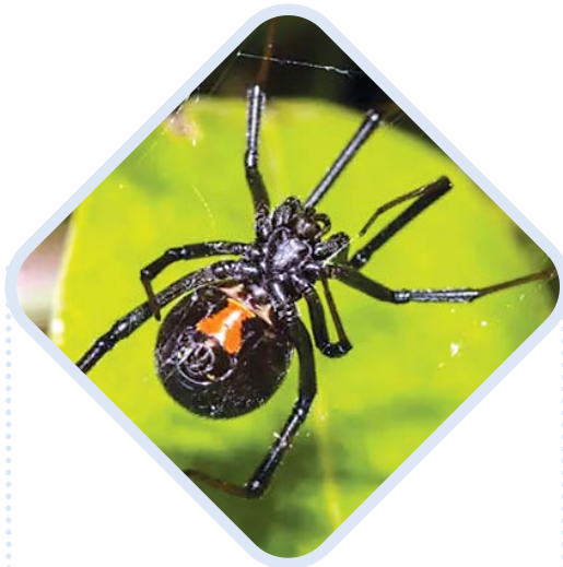
Black Widow Spider

Arizona bark scorpions are the most venomous scorpions in North America, a frightening fact considering that they're also the most commonly encountered house scorpions in Arizona. The venom causes acute pain and can lead to symptoms that include frothing at the mouth, breathing difficulties, and muscle convulsions. Limbs may also become immobilized. Though the venom is rarely fatal, its effects can last for as long as 72 excruciating hours. Arizona bark scorpions tend to hide in dark crevices during the day and hunt at night.