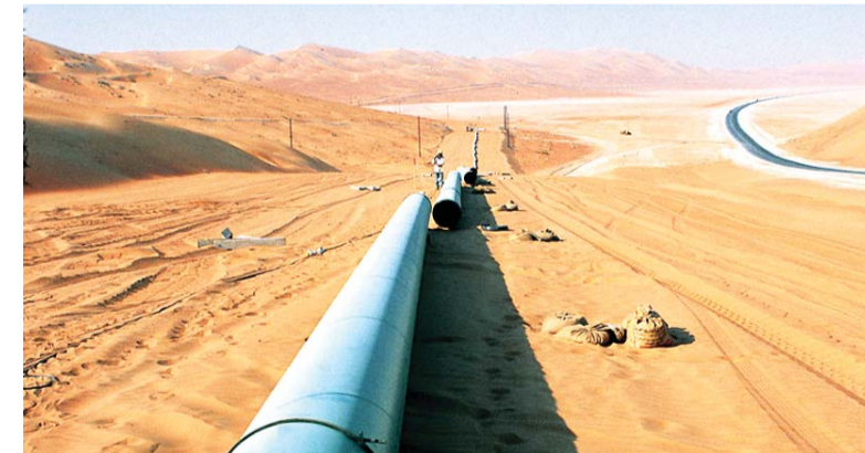
Gas pipeline between Qatar and Turkey.

Turkey has been a long-term supporter of the Hay'at Tahrir al-Sham (HTS), which had early links to the Islamic State, and then to Al Qaeda. Without the HTS,