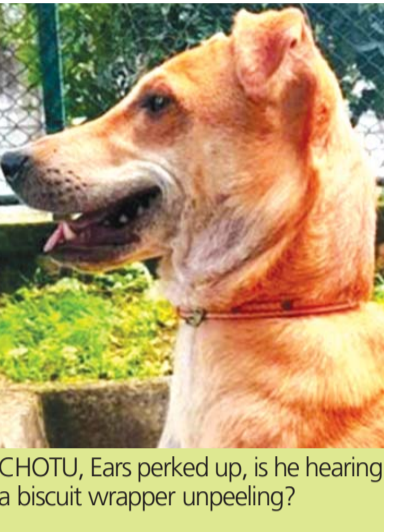
CHOTU, Ears perked up, is he hearing a biscuit wrapper unpeeling?

Rowdy was as good as his name, playful and mischievous, but strong-willed and a trifle aggressive to those he disliked or felt threatened by. Our Rowdy has bitten everyone from his canine and human menagerie. Compulsory vaccination for Rowdy as well as preventive injections, personally for me, was de rigueur. For the rest of my clan, complete trust in Rowdy's goodness meant only the annual poke for the blighter.