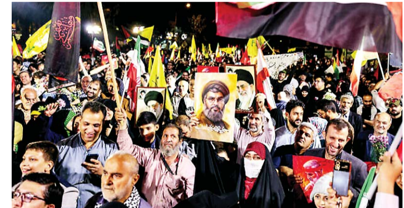
People rally after missile strike in Israel, on October 1, 2024.