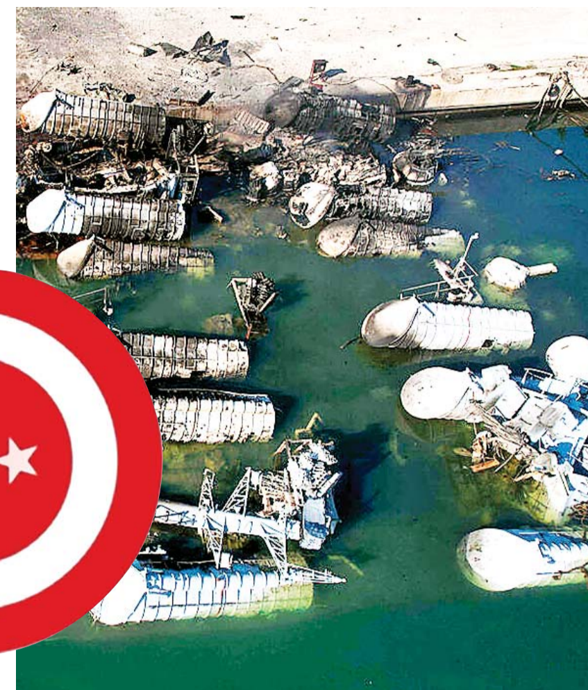
Syrian naval fleet in Latakia.

With a pro-Turkish government in the saddle in Syria, they will be looking at the freedom to operate against the People's Protection Units (YPG) outfit in Northeastern Syria. The YPG spearheads the US-backed Syrian Democratic Forces (SDF), and is considered by Turkey to be part of the PKK, which has fought against the Turkish state for decades.