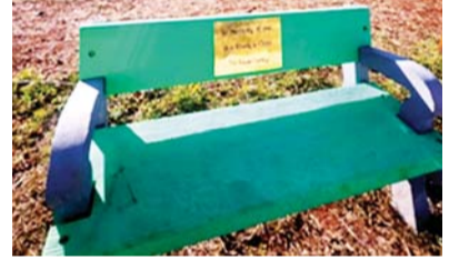
And last but not least, the bench at the Bow Bow Pet Resort, where close by dear Rowdy and Chotu lie together in eternal rest.