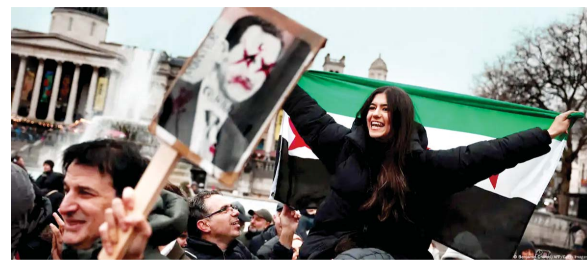
Bashar al-Assad gone.

port of South Africa's genocide case against Israel at the International Court of Justice. It has suspended trade with Israel and blocked co-operation between Israel and NATO. The Turkish President has even thought about an armed intervention in Gaza. These highlight just how badly relations had deteriorated.