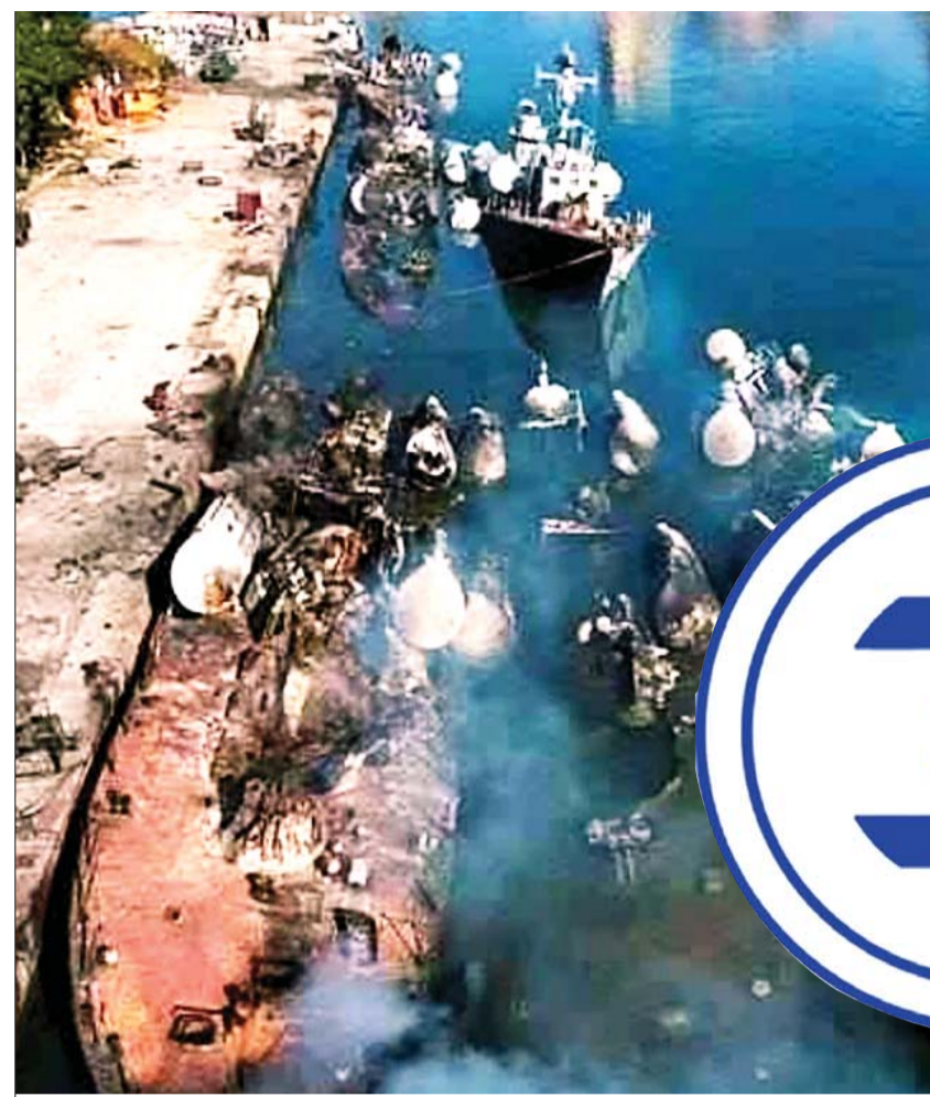
Charred remains of Syrian ships after Israeli strikes.