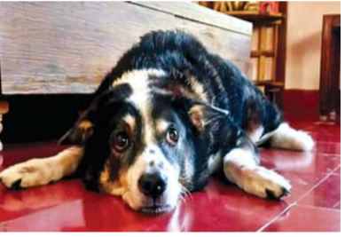
ROWDY, Wise but wild, don't be deceived by his mournful eyes trying to capture your hearts.