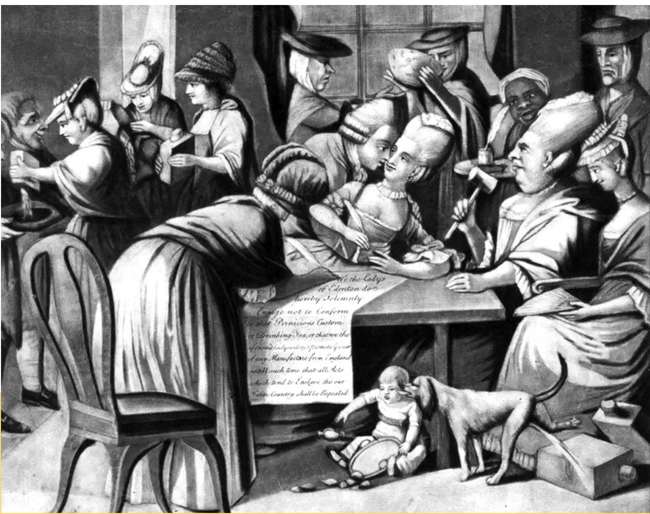
A London political cartoon satirizing the Edenton Tea Party.

Observed on September 6, International Bacon Day is a lighthearted celebration dedicated to one of the world's most beloved breakfast staples. What began as a quirky tradition among friends in the U.S. has grown into a global event, with bacon-themed recipes, festivals, and social media tributes marking the day. From crispy strips to gourmet bacon-infused dishes, the occasion encourages food lovers to indulge in creativity and savor the smoky flavors. Beyond taste, it's also a chance to share laughter, camaraderie, and the universal joy that a plate of bacon brings to gatherings.