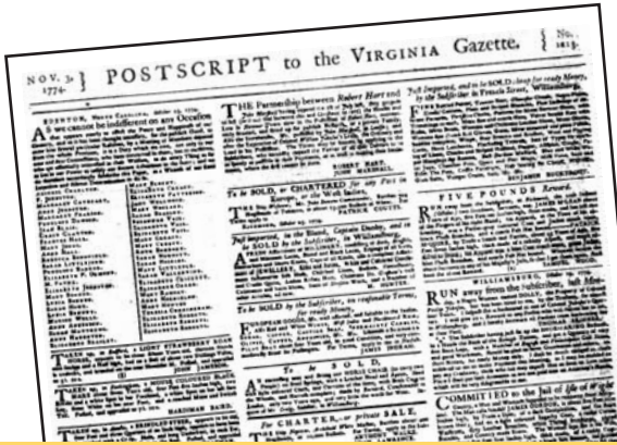
The women's resolution was reprinted in the Virginia Gazette on November 3, 1774.

The Edenton Tea Party wasn't an isolated incident. It was part of a wave of protests against Parliament's 1773 Tea Act, a corporate tax break that lowered the price of tea for colonists, encouraging them to buy taxed tea and, by extension, agree to taxation without representation.