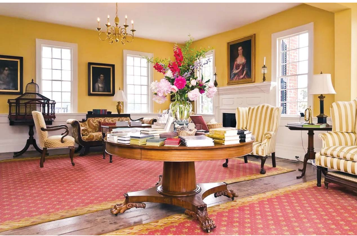
A portrait of Barker hangs in the living room of her former home.