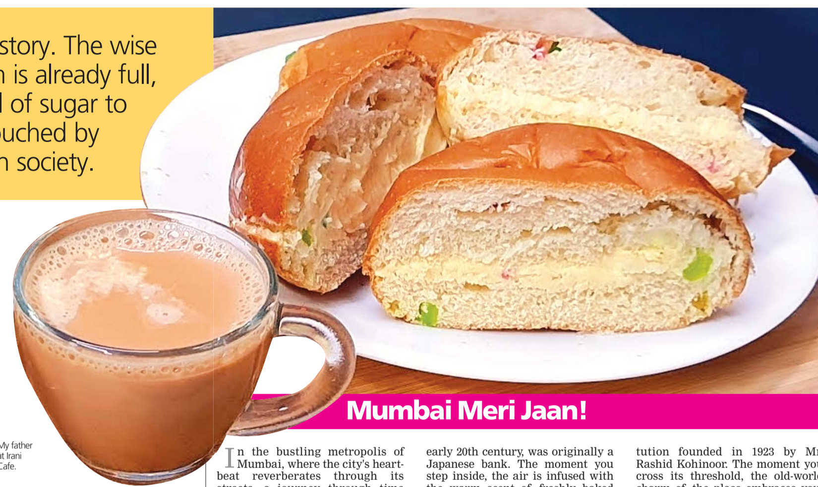
Mumbai Meri Jaan!

So, step into the world of Irani cafes with an open mind and an appetite for the extraordinary. Embrace the unassuming settings, the mismatched furniture, and the bustling atmosphere that fills the air. In these unassuming spaces, you'll discover a magic that cannot be quantified, a charm that transcends fancy facades.