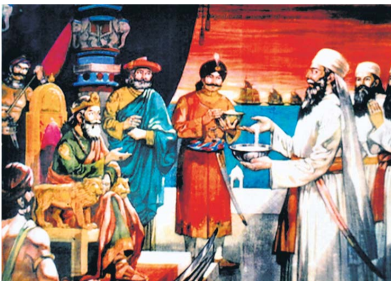
The Story of the Arrival of the Parsis in India.

When the Parsis arrived in India, they brought with them this cherished tradition of tea, adapting it to suit the Indian palate. It was in the charming interiors of our tea houses that the magic truly unfolded. The art of preparing Irani chai became a revered ritual, with tea leaves carefully simmered in large copper pots, infused with cardamom, cinnamon, and a hint of saffron. The addition of creamy buffalo milk elevated the tea to new heights of decadence, creating a velvety texture that enveloped the taste buds with each sip.