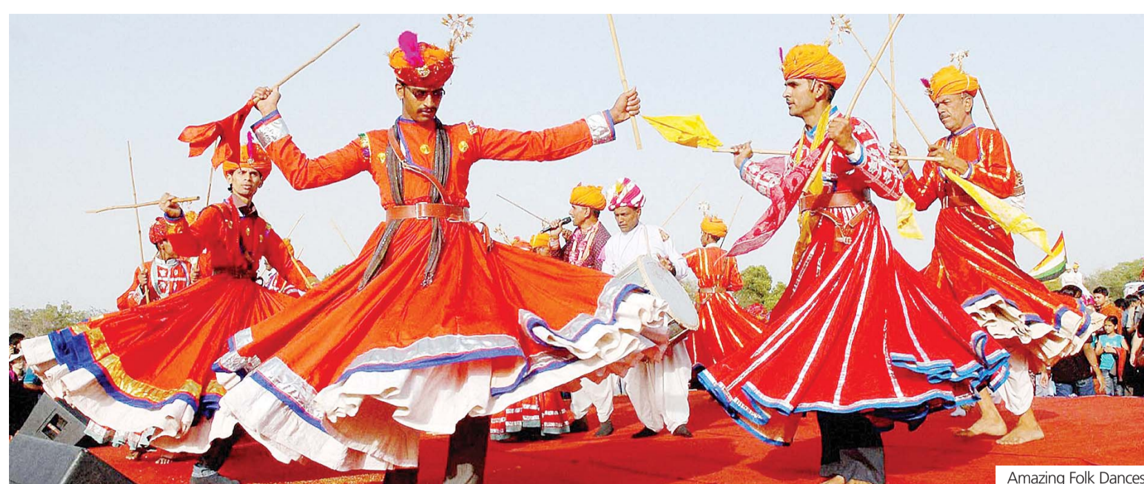
Amazing Folk Dances.