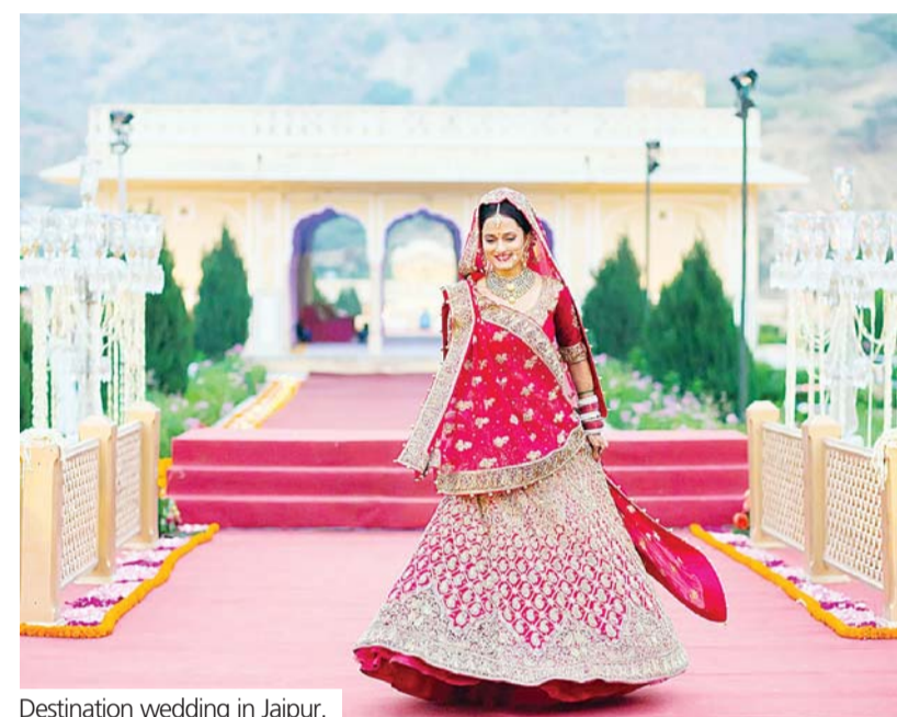
Destination wedding in Jaipur.

built in 1729 for a Sisodia princess who wished to distance herself from the intrigues of the Zenana at the City palace it later became the residence of the British Residents and later also of their royal Highnesses of Jaipur. It was then that it earned the sole distinction of having hosted Queen Elizabeth and Prince Philip and Jacqueline Kennedy on another occasion as private guests.