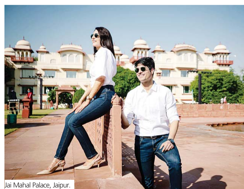
Jaipur Mahal Palace, Jaipur.