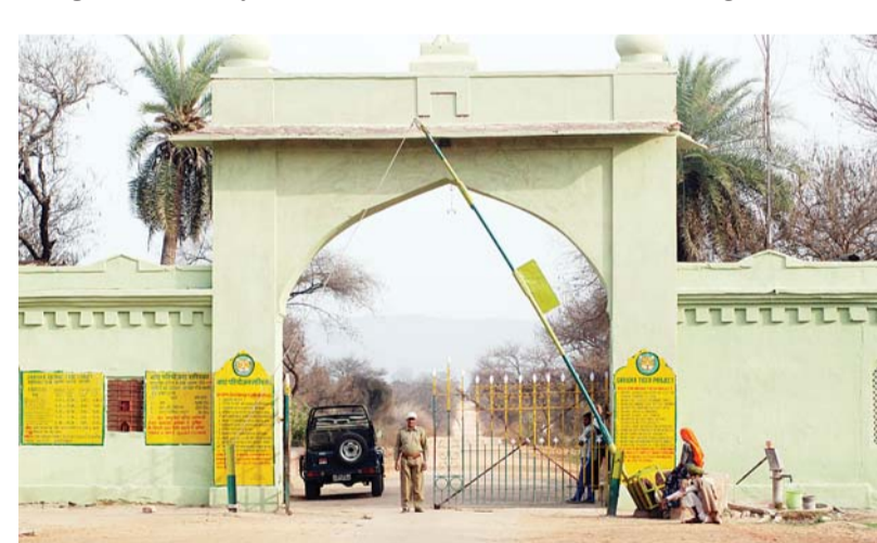
Main entrance gate to Sariska Reserve.