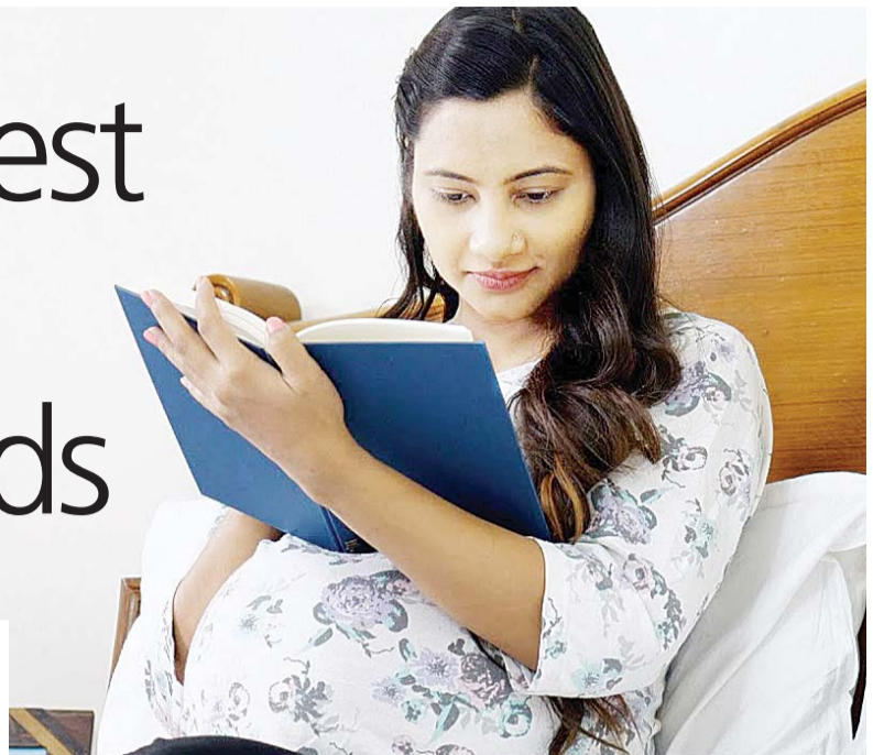
The best age to learn a second language.

Parenting a new human means making sure they have all the skills they need to thrive. But that can be a stressful proposition not least because of all the conflicting advice out there.