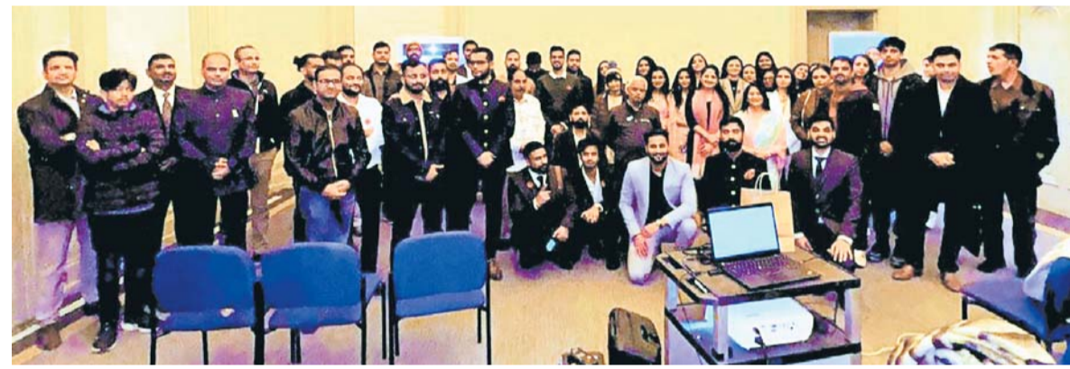
Group picture from the event.