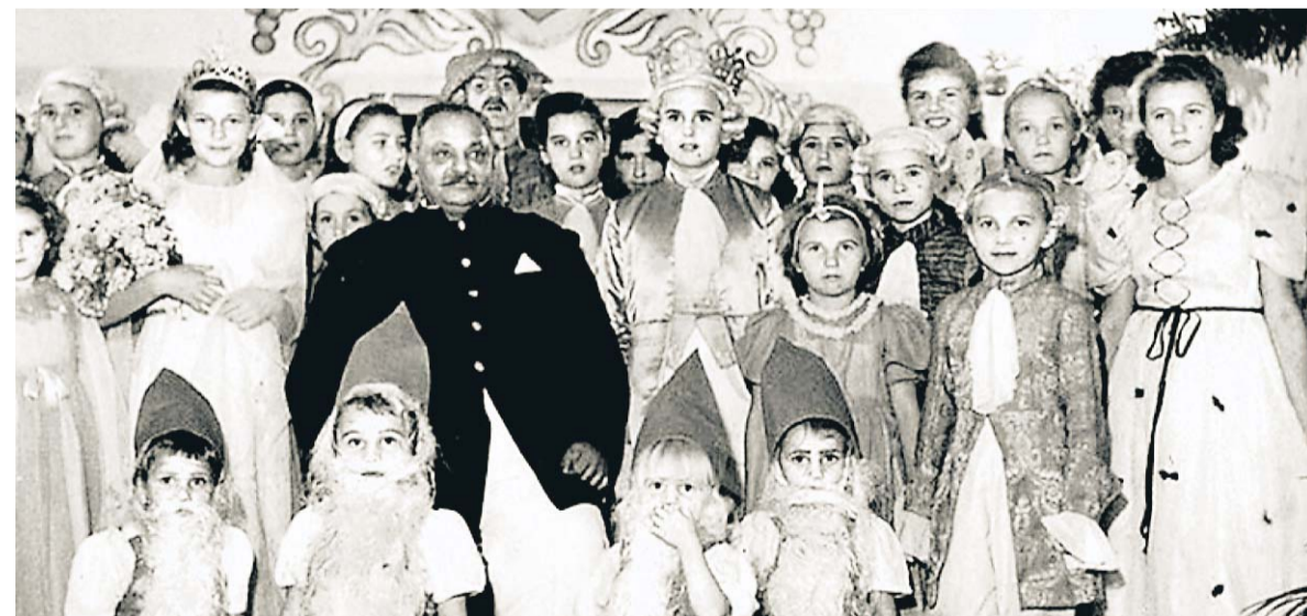
Maharaja Digvijay Singh Ji Jamnagar with Polish Children.

Rajput Raja and Maharajas, epitomized by Maharaja Sri Pratap Singh Ji idar's introduction of Jodhpur pants, exerts an irresistible allure. Originating in