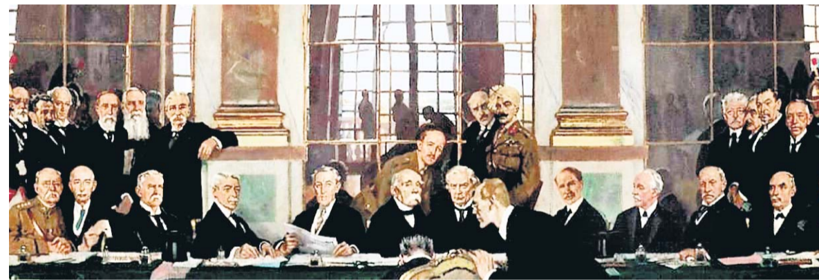
Treaty of Versailles, 1919, ended WWI. Maharaja Ganga Singh: Indian signatory, pivotal event.

exceptional hospitality shines through, in providing sanctuary to the Polish in Jamnagar, under the King's benevolence. Shifting focus to leadership, Rajputs emerge as beacons in every army, epitomized by Maharaja Ganga Singh Ji Bikaner. A seasoned soldier who traversed the landscapes of China, France, and Egypt, he stands as the sole non-white member of the British Imperial War Cabinet in the First World War, the only Indian signatory of the Treaty of Versailles (1919) and the pioneering Indian to attain the esteemed rank of General in the British Army. This indomitable spirit extends to the Dogra regiments, meticulously crafted by the J&K Maharaja and the Raja of Kangra, even establishing a gun manufacturing factory for World War endeavors.