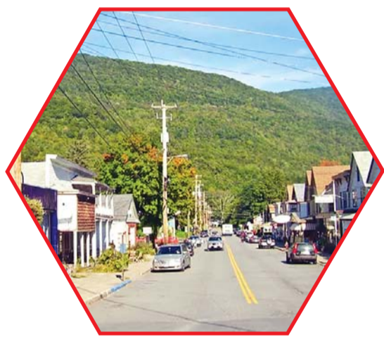
Catskill Mountains (New York)

Gold seekers have now returned to Auburn, inspired by rising gold prices and TV shows that follow the exploits of modern-day gold miners. Many of Auburn's new prospectors pan for gold along the American River in the Auburn State Recreation Area. Some boost their chances by using metal detectors. The Recreation Area office has published a list of rules for prospectors: Pans are the only 'tools' allowed, findings must not be sold for profit, and no one may gather more than 15 pounds of mineral material per day, etc. In the past, people have actually been arrested for trespassing and taking gold from property owned by private mining companies.