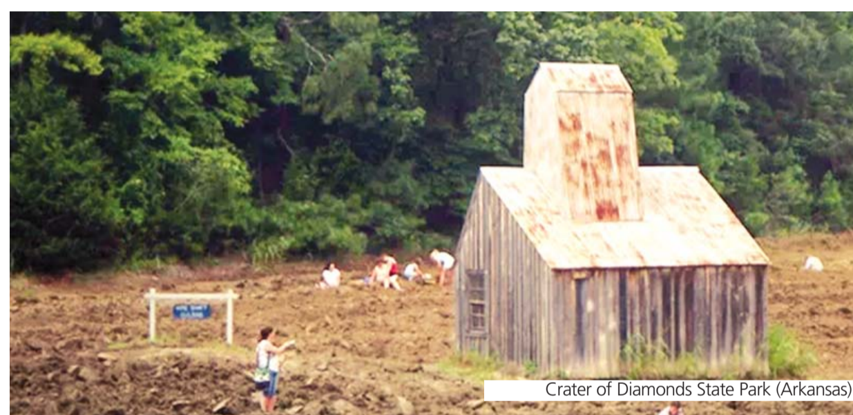
Crater of Diamonds State Park (Arkansas)