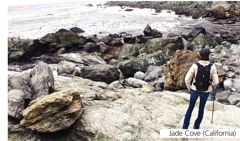
Jade Cove (California)