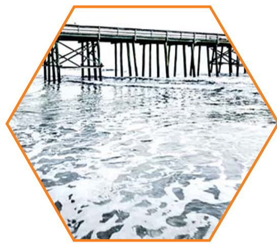
Amelia Island (Florida)