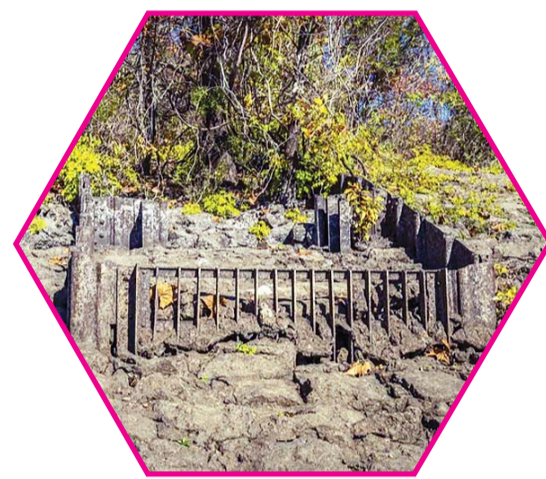
Ozark Hills (Missouri)