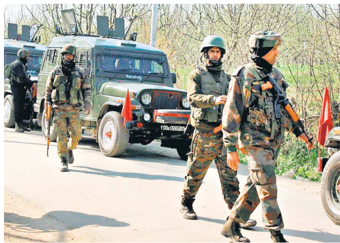
Action in Tangdhar, Kashmir.