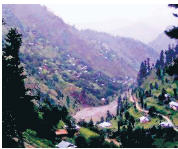
Village Chak Mukam is where the river disappears on the right of the picture.

You have done your job." The Brigade Commander, however, was not so forgiving.