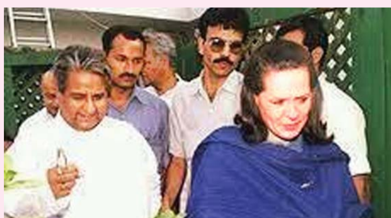
Kalpanath Rai And Soniya Gandhi.