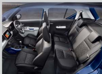
Spacious and Comfortable Interiors