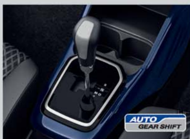
Auto Gear Shift