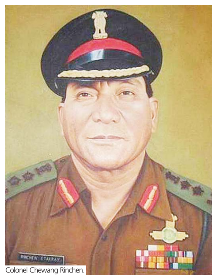
Colonel Chhewang Rinchen.

The 1971 War got him his second Maha Vir Chakra. Many years later, General Arun Vaidya also a recipient of two Mahavir Chakra's set aside the rule book by promoting Major Rinchen to a Lieutenant Colonel when he was the Chief. His promotion had been held up as he had lost seniority for failing to pass the mandatory Promotion exam in time.