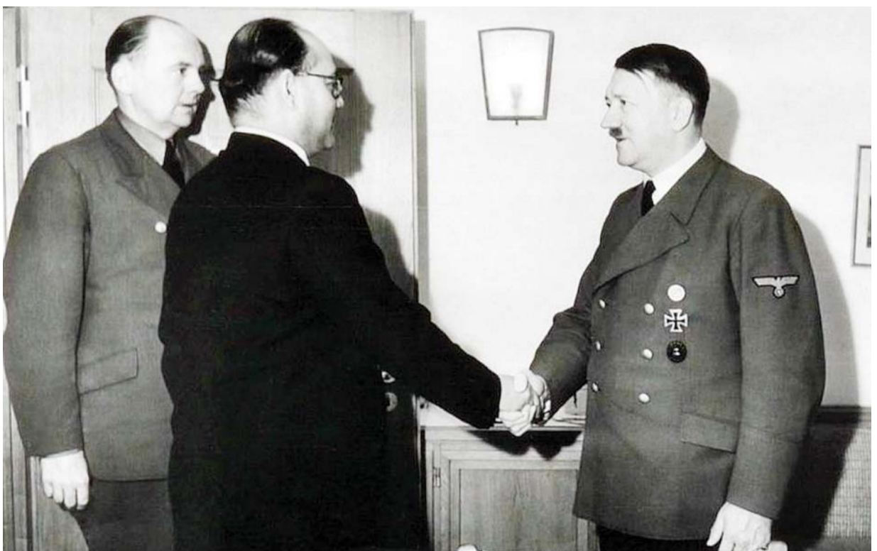
Netaji Subhash Chandra Bose with Hitler.