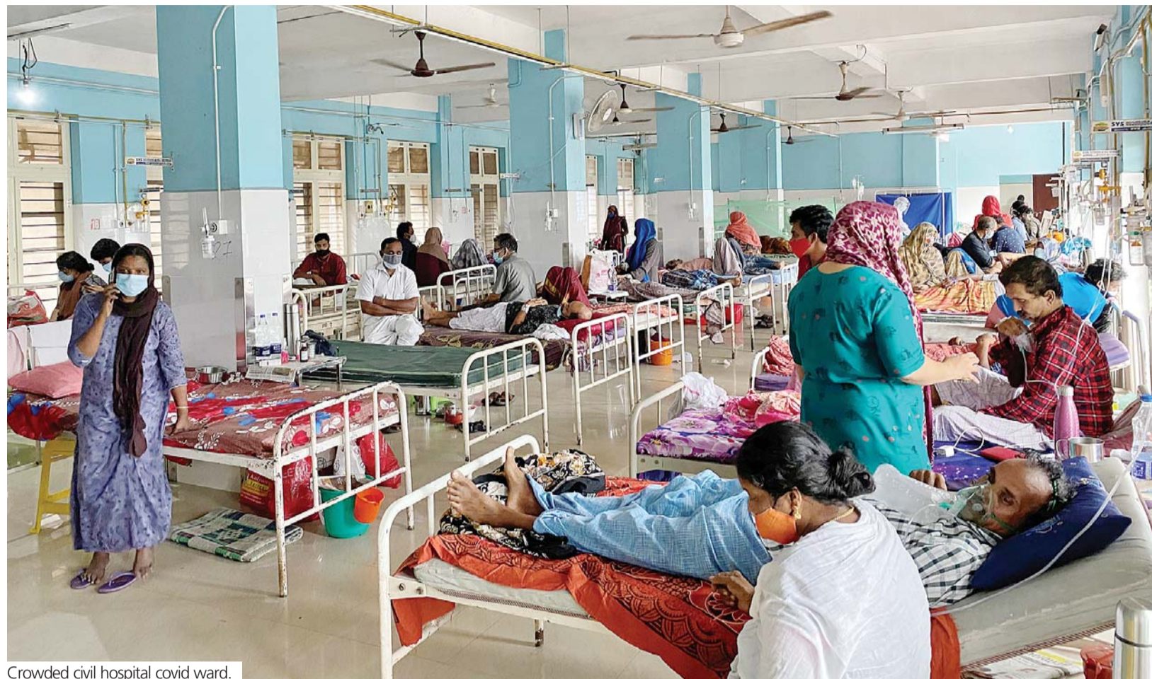
Crowded civil hospital covid ward.

The army is a very hierarchal and status conscious organization and there is a well laid down pecking order. Having left the army fifty years ago as a lowly major, I make no claims nor expect to receive any special attention. But in mid-December, I was admitted to MH Jaipur with a bad bout of Asthma and spent three days in the ICU.