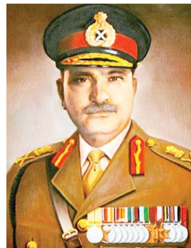
Lt Gen Prem Bhagat, PVSM, VC.

He and I shared the same ward for a couple of days till I was sent off to MH Gauhathi for further treatment. During our conversation, he told me that it was hard for him to