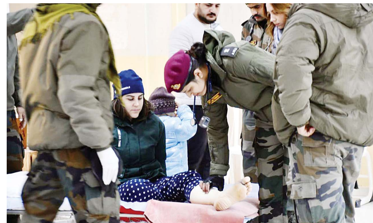
Indian army field hospital in turkey.

of the pilots of the RAF said: "Never has so much been owed by so many to so few" never would we have realized that this is more true for our doctors and nurses who have seen us through the worst time in human history when the entire planet was cloaked in death and depression. When everyone else retreated to the safety of isolation in their homes, the doctors and nurses were out caring for the sick and dying. Doing their duty at great