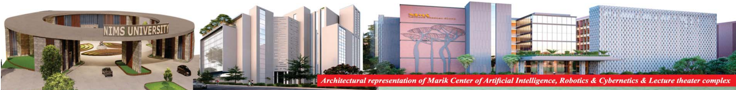
Architectural representation of Marik Center of Artificial Intelligence, Robotics & Cybernetics & Lecture theater complex