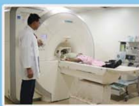
1.5 टेस्ला एम.आर.आई.