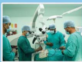
मॉड्यूलर ऑपरेशन थियेटर